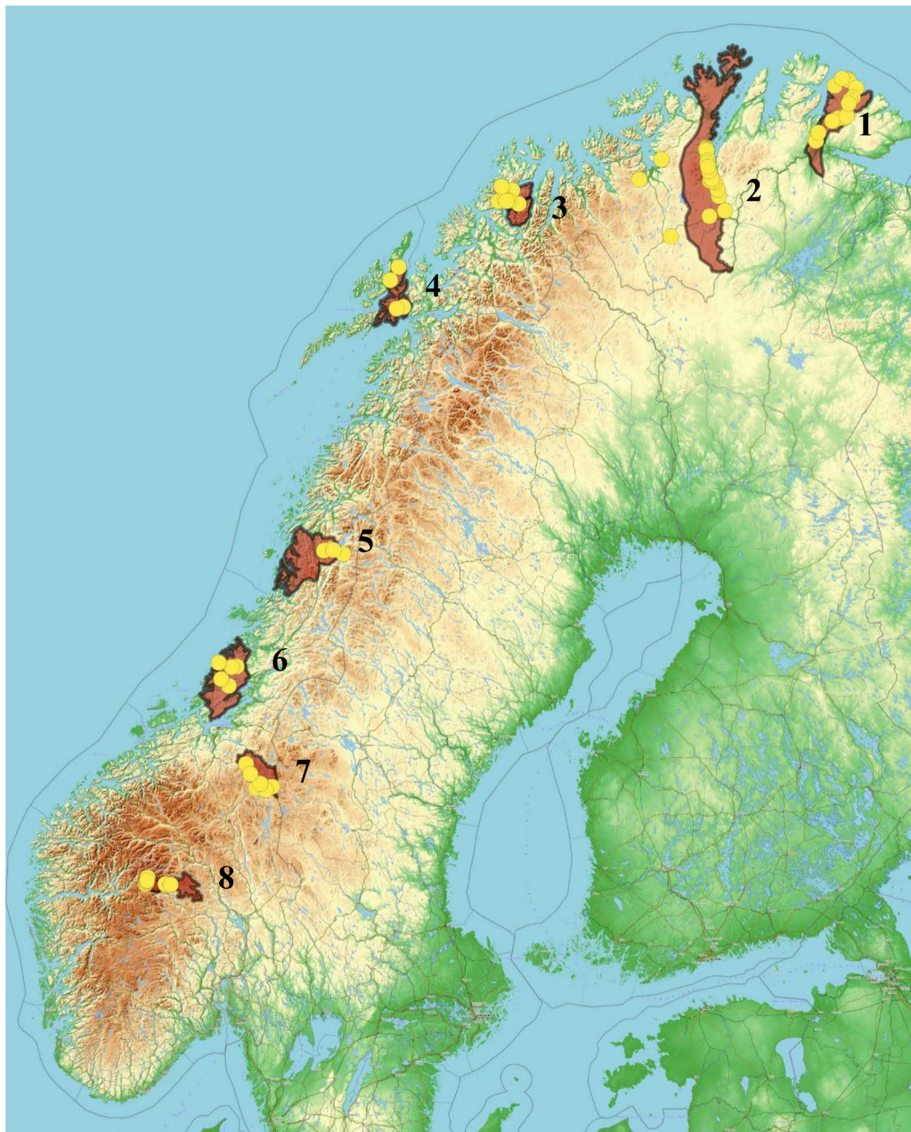
Fig. 1 The map illustrates the sampling locations where the blood sucking insects (BSI) and reindeer sera were collected. 1: Tana, 2: Lakselv, 3: Tromsø, 4: Lødingen, 5: Hattfjelldal, 6: Fosen, 7: Røros, and 8: Valdres. The brown areas represent the summer pastures for each of the reindeer herds, whereas the yellow dots indicate the sampling locations for blood sucking insects (BSI) in or in the vicinity of each summer pasture

and reverse primers were 0.25 \mu\text{M} each. The optimized cycling conditions were: 55 °C for 30 min, 95 °C for 2 min followed by 45 cycles of 95 °C for 15 s, 60.5 °C for 30 s and 72 °C for 1 min, before a final extension at 72 °C for 5 min and 4 °C until the PCR products were further analysed. The PCR products were visualized on E-Gel ® 48 Gels (2% agarose) with EtBr according to the manufacturer's protocol (Invitrogen, Carlsbad, CA, USA) and stored at