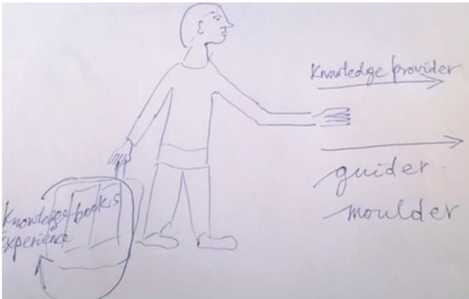
Figure 3. Qualities of a Good Teacher.

The drawing (Figure 3) depicts the teacher educator as a possessor of knowledge, books and experience, aiding to move forward as a knowledge provider, a guide and a moulder. Again, the orientation here is towards an education professional who is committed to