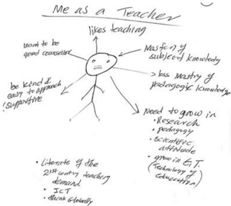
Figure 1. 'Me as a Teacher'.