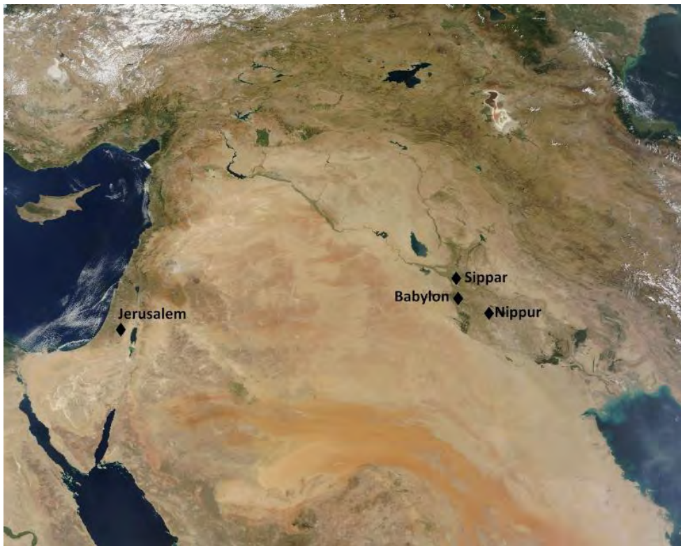
Map of the Near East, indicating the location of Jerusalem, Sippar, Babylon, and Nippur.

When King Nebuchadnezzar II of Babylon conquered the kingdom of Judah in the early sixth century BCE, part of Judean population was deported to Babylonia. These events had a huge impact on the development of Judaism, and many books of the Hebrew Bible reflect the trauma of the exile. The Hebrew Bible offers, however, little information about the exilic life in Babylonia. A growing number of Babylonian cuneiform texts shed light on this question.