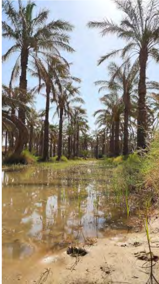
Modern irrigated date palm grove in Iran. Palm groves in the Nippur region were probably quite similar to the one depicted here.

Most of the Judean deportees were settled in the Babylonian countryside around Nippur and integrated into the so-called land-for-service system. They got a plot of land to cultivate, and, in exchange, they had to pay taxes and perform work and military service. Under this scheme, new land was brought under systematic cultivation by dependent settlers who were closely controlled by the state, ensuring efficient extraction of taxes. Judeans were only one of the many groups of deportees who were brought to the Nippur region and settled in villages according to their place of origin. The names given to these villages, such as Ashkelon, Hamath, and Yahudu, the village of Judah, attest to this phenomenon.