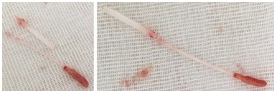
FIGURE 2: Nasal swab

CT scan showing the swab (arrow) behind the septal spur in axial and coronal view (A,B) and the entire swab in the sagittal projection (C,D,E) reaching the nasopharynx and after rupture dislocated in the upper part of the nose and also migrated below the middle turbinate.