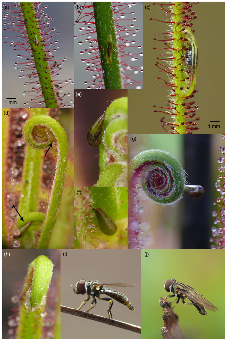
Figure 2. Life cycle stages of Toxomerus basalis documented in situ in Minas Gerais, Brazil. (a) first-instar larva L_1 (b) L_2 larva (c) L_3 larva, figures 1a–c to the same scale. (d) L_3 larva attaching to pupate on a freshly enrolling Drosera leaf (arrow), note another puparium (arrow with *) on a developing leaf in bud on the same plant. (e) Puparium. (f) L_3 larva starting to pupate on a leaf base. (g) Puparium with emerging pharate adult – note the translucent puparium exoskeleton with opening fissures visible at the anterior end. (h) empty puparium exuvia on a developing Drosera leaf. a–c on Drosera spiralis , Parque Nacional das Sempre Vivas, Buenópolis, Minas Gerais, 06 December 2018. d–h on Drosera magnifica , Pico do Padre Ângelo, Minas Gerais, 04 December 2018. (i) + (j) adults resting on exposed perches near their Drosera hosts: (i) female, Rio das Lajes, 06 December 2018. (j) male, summit of Pico do Padre Ângelo, 04 December 2018.