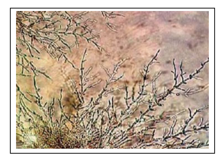
Figure 2.3: Candida parapsilosis growth on cornmeal agar. Adapted from (Prasanna et al. , 2016)

Germ tube test is a rapid method for the identification of C. albicans and C. dubliniensis by its capability to produce short, slender, tube-like structure called germ tubes when incubated in human blood serum at 37°C for 2-3 hours. This structure is distinguished from pseudohyphae by the fact that it results from the extension of daughter cells from the mother cell without constriction at the origin (Aldossary et al. , 2016). C. parapsilosis is germ tube negative (Walsh et al. , 2018).