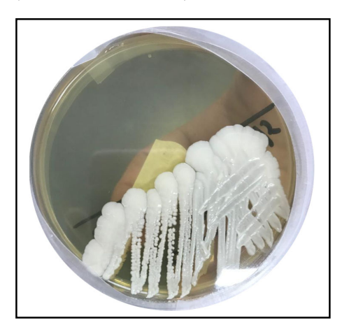
Figure 2.1: Candida parapsilosis colonies on SDA.

The SDA plates are usually incubated after inoculation with the yeast at 20-25°C for 5-7 days or at 30-35°C for 24-48 hours (ThermoScientific, 2019). When grown on SDA, colonies of C. parapsilosis (Figure 2.1) are white, creamy, shiny, and smooth or wrinkled (Sharma et al. , 2019).