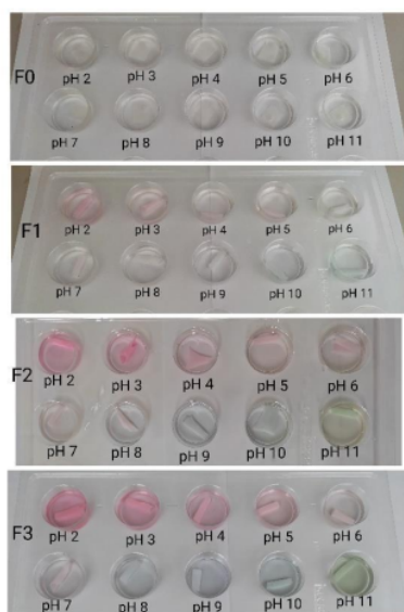
Figure 3. pH Sensitivity of Indicator Films. F0 = without-extract film, F1 = film with 5% of extract, F2 = film with 10% of extract, F3 = film with 15% of extract.