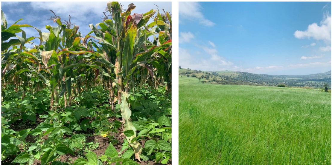
Figure 5. Use of farmyard manure and intercropping (beans and maize rotated with barley after every two seasons).

fertilizers, but after scanning I [...] use farmyard manure and intercropping between maize and beans to increase soil nitrogen and agriculture productivity. Now I am getting 7–9 bags of maize in the same piece of land. However, for barley, this is my first season to rotate farms with maize and beans and by the look of it – I will get high produce.