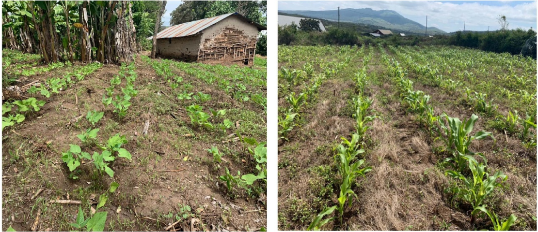
Figure 4. Changes in practice (mulching and crop rotation with maize and beans) resulting from scanner soil quality data linked to available technical advice. Source: Authors.