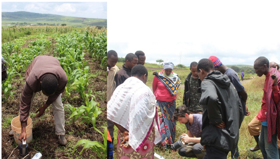
Figure 2. Community soil scanning.

Once the trial programme and sample locations had been designed and agreed with the community, the research team was guided around the village by the Village Officer. The sample locations were visited on foot and scan measurements were made by farmers, supported by the research team (figure 2). In addition, the team walked most of the trails in the area, so that farmers who were out working on their land could also be approached and asked if they would like to participate, enabling the inclusion of those who had not participated in the original workshop. Farmers chose the scanning locations on the farms themselves which was, depending on the size of their farms, mostly done in two or three areas of differing productivity, either in the same, or in different fields.