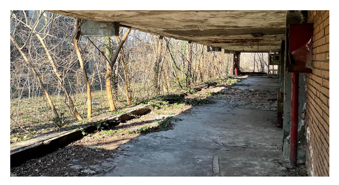
Figure 3. Istituto Marchiondi from Vittoriano Viganò, Baggio (MI), ph. Valentina Labriola (2022)

Concerning wasteland, the intention is to restore or demolish more abandoned areas as possible in the case of buildings. This action shows the usual tendency of the architecture in the design of the vacant space. The propensity is planning these spaces, trying to include them in the city through a violent transformation that denies the unique qualities of the wasteland instead. Urban voids can trigger the imagination of new alternative public spaces while simultaneously positively influencing the ever-present re-urbanization and re-naturalization process (Lopez-Pineiro, 2020). These places' ecological and socio-cultural power allows the design of a new kind of open space that considers the presence of an unseen nature. As Gilles Clément argues, "Abandoned areas constitute the principal refuge for the pioneers of exhausted, bare, 'turned over', or littered soil" (Clément, 2002, p.111). Indeed, it is visible how nature affects the voids in different aspects, firstly, in the aesthetic.