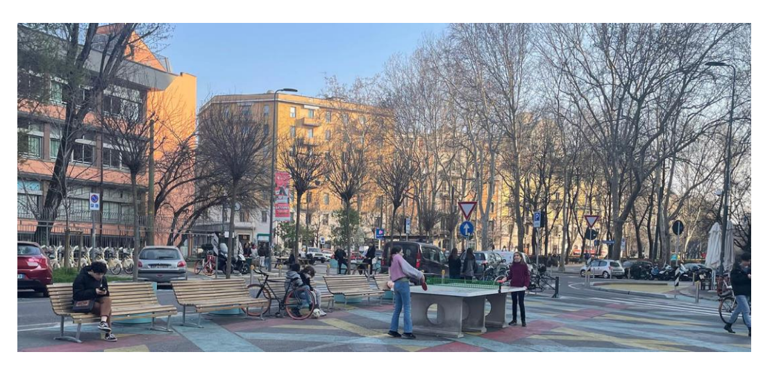
Figure 1. "Piazza Aperta" in Piazzale Bacone, Milan

It is unequivocal how the effect of the COVID-19 crisis does not affect only our private everyday life but also the way we live in the public space. However, it is possible to consider the positive impact of re-thinking the contemporary city meaning through its community places. The answer of the public administrations was usually accelerating some public actions. The Metropolitan City of Milan promoted, for example, a considerable intervention both in public space use and slow mobility.