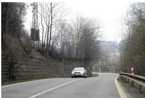
Figure 5. I/57 road in the model site Brňov. The retaining wall in combination with the railway line forms an absolutely impassable barrier.