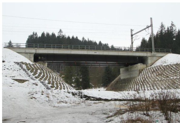
Figure 4. Railway bridge near Mosty u Jablunkova. Originally a small culvert enlarged into a passage suitable for all animal species during the modernisation