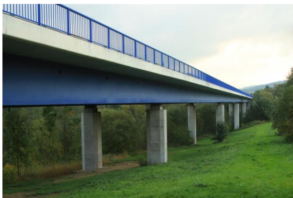
Figure 3. Site Jablunkov, bridge nr. 11-193. The crossing of the migration corridor at Jablunkov through the I/11 road is secured by a 440 m long flyover bridge.

The evaluation of objects usable as potential passages for large and medium-sized animals resulted in the discovery that suitable structures are located only on the relatively newly built I/11 road near Jablunkov and the railway line there (Figure 3,4,6). The other older roads, despite high traffic intensity, do not have suitable structures, on the contrary, the permeability is degraded by the structural-technical layout of the road, e.g. in the form of a retaining wall (Figure 5).