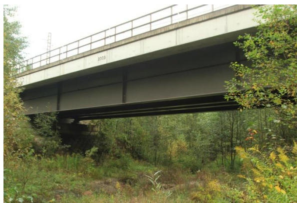
Figure 6. Railway bridge in Jablunkov. Another example of a structure adapted to wildlife migration during railway reconstruction