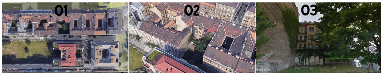
Figure 1. Showcasing how vertical greenery is clearer in a street view.

The next figure shows a quick glimpse on how cityscape elements can be perceived differently depending on how we perceive an image from a bird’s eye view or from the side.