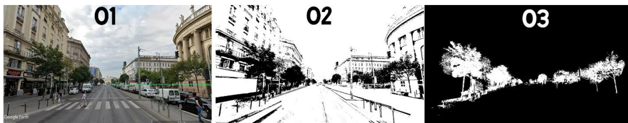
Figure 2. Showcasing my process of filtering greenery in GSI using filtering and editing tools.

To begin with understanding the green area quantity or ratio in our perspectives which are taken from Google Street View Imagery, the images are taken in a position of human perspective borrowed from GSVI then taken to analysis. The focus is on the green colour compared to blue and red lines where filters are subjected to change using any high quality photo editor or separator, in my situation I have used Adobe Photoshop to filter colours into black shades. This method of colour filtering and keeping the greenery could be done in many different ways if you have photo editing expertise, one way is the following: The main image is duplicated, then desaturation option to the maximum is used, next the colour range option from the option toolbar is picked which will help to choose the colour range. An important tip I usually follow is selecting multiple points which allows me to add multiple shades of green to the sample.