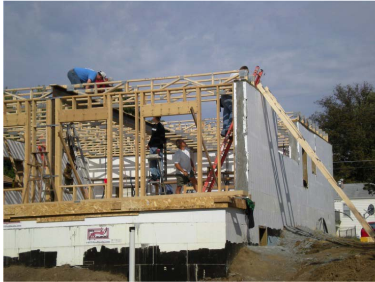
FIGURE 2. Students working on ZNETH.

other alternatives (EMEGA Biopolymers, 2010). Typical residential construction is wood framed 2 by 4 walls. Typical fiberglass insulation in the three and a half inch cavity provides an R-value of 11. Open cell soy based insulation in the same space provides an R-value of 12.6 or R3.6/inch. The equivalent space using closed cell would provide an R-value of 23.8 or R6.8/inch. This results in an R37.4 for the 2 by 6 walls using closed cell insulation. In addition, the closed cell provides some additional structural support that allows 24" spacing between studs reducing the amount of wood in the structure.