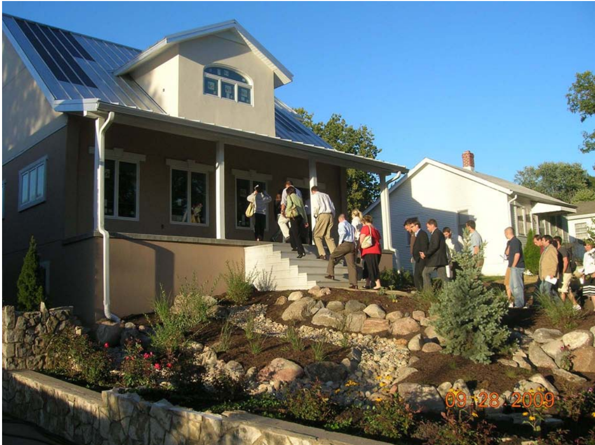
FIGURE 3. Exterior view of final project.