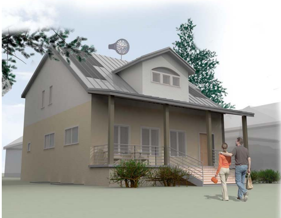
FIGURE 1. Final ZNETH design.