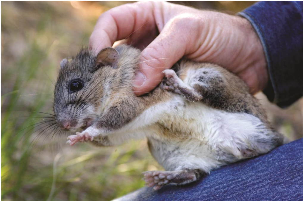
FIGURE 2. The dorsal side of the body is darkly colored while the underside and feet are white or light gray.