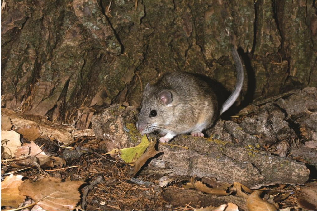
FIGURE 1. The tail length of the Bailey's eastern woodrat is less than the combined length of the body and head. The tail is completely furred with short hair, unlike the scaly tail of the invasive Norway rat.