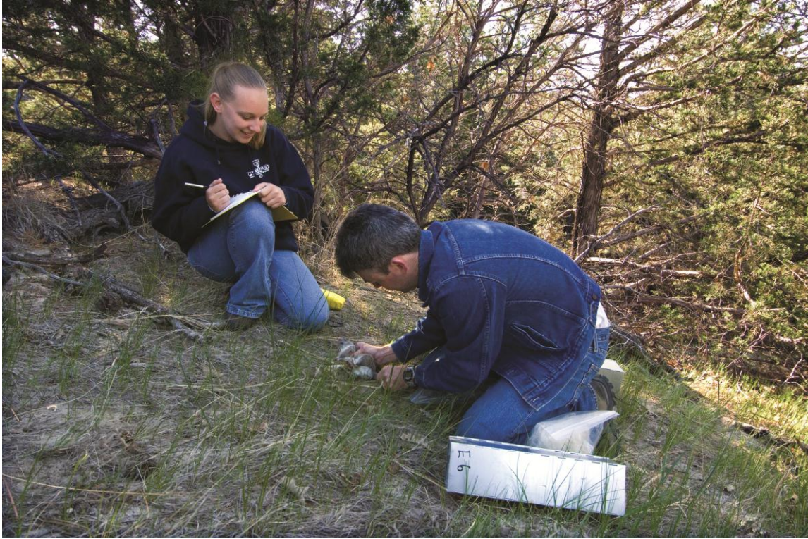
FIGURE 5. Researchers from Wartburg College use live traps to capture Bailey's eastern woodrats in order to collect data on their mass, age and sex.