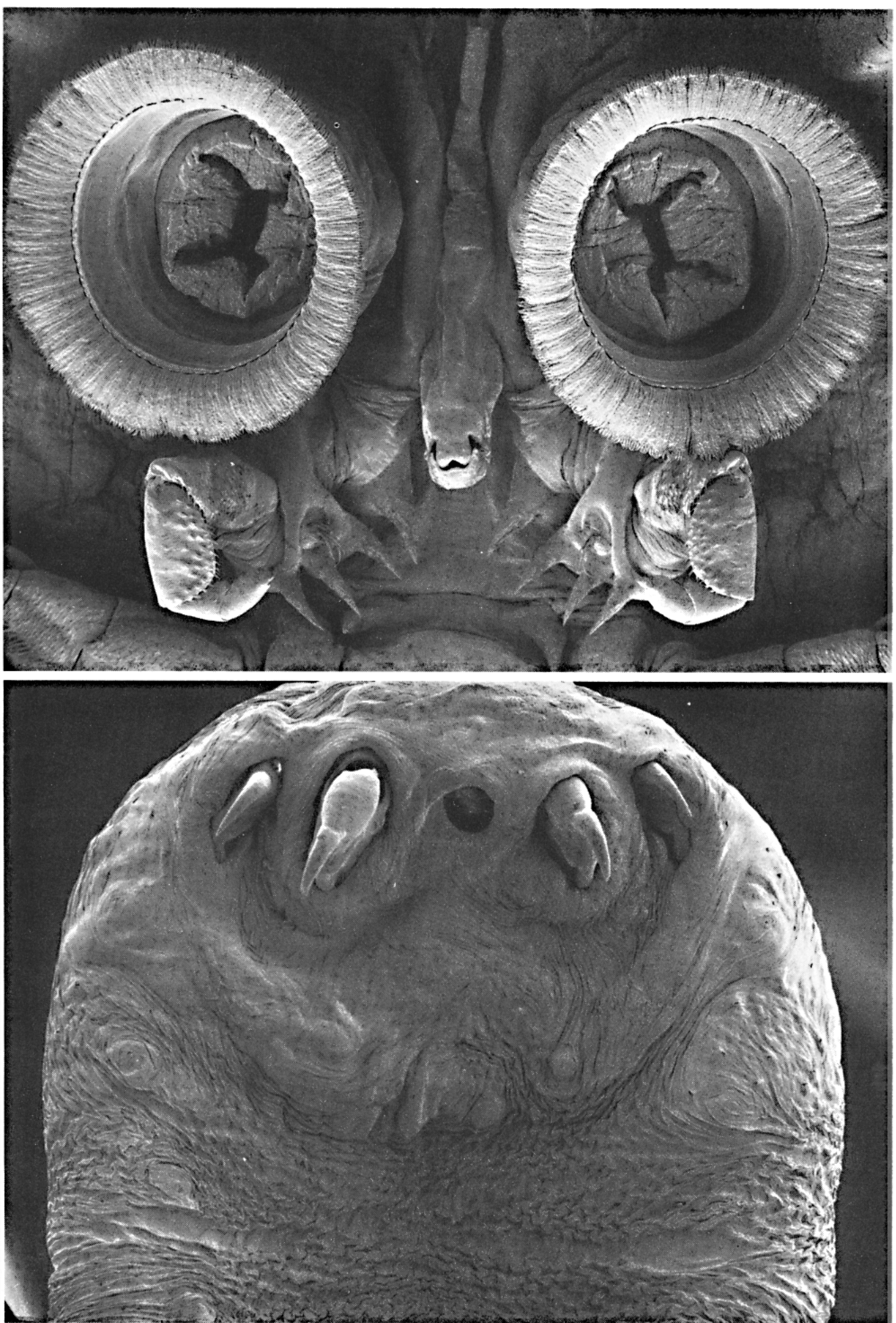
FIG. 1.—Anterior, ventral surface of Argulus nobilis (top) and anterior portion of Porocephalus crotali (bottom). Both photomicrographs are by SEM.