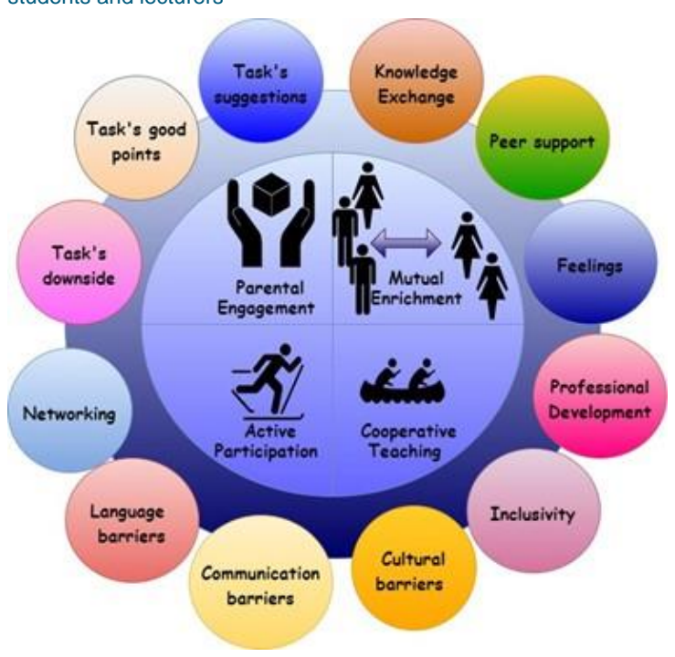
Figure 1 Themes organised in a framework of analysis. The diagram has been created using the app diagram.net