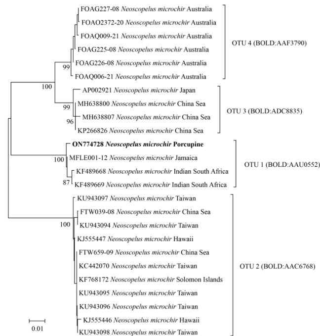
Figure 3. Neighbor-Joining cladogram of the COI marker of Neoscopelus microchir specimens. There were 652 positions in the final sequence alignment. The numbers at the nodes indicate the percentage of tree resampling per bootstrap. The scale indicates the number of substitutions per nucleotide. The sequence of the specimen captured in Porcupine Bank is marked in bold. The correspondence between OTUs and BOLD BINs is also shown.