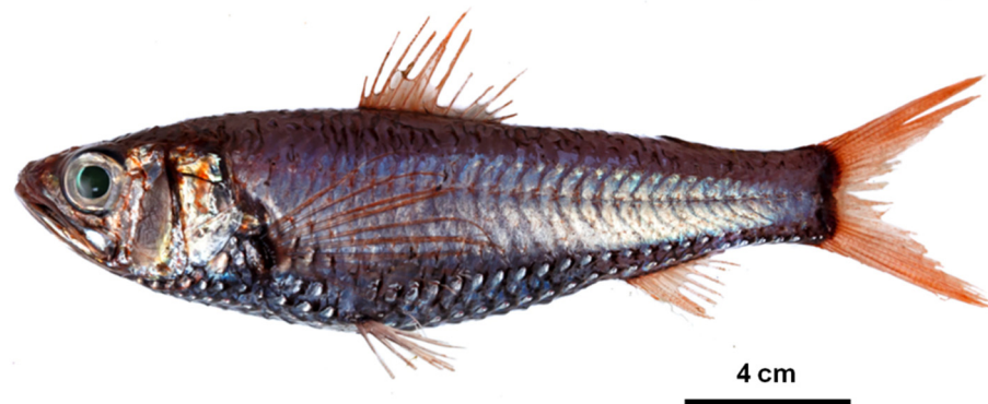
Figure 1. Neoscopelus microchir MHN USC 25200, 223.2 mm TL, caught in the Porcupine Bank, southwestern Ireland.