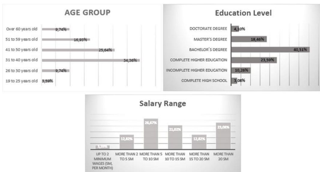
Scheme 1. Respondents' profile.