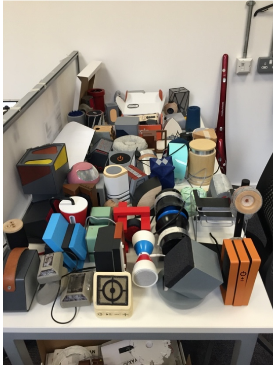
Figure 5 A table of prototypes

In professional studios, gathering fulfils two functions, the studio is a ‘reservoir’ (Hennion 2016) to gather things like materials, supplies, images, found objects, and books, and the studio is an archive for remembering; the studio stores previous ideas, artefacts, experiments and failures. Here gathering is a form of ‘material memory’ (Farias 2016: 204). The emphasis on gathering underscores the essential role of materials in creative knowledge processes.