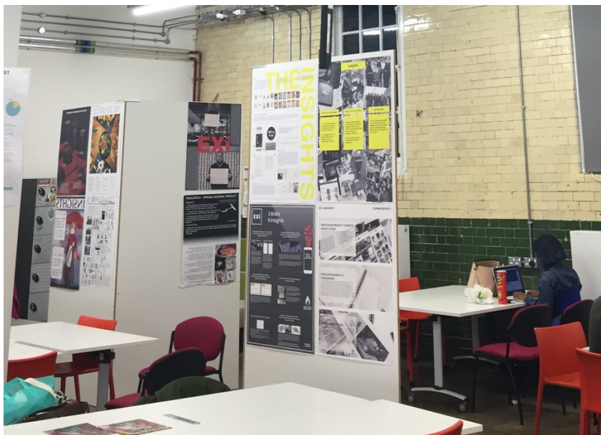
Figure 7 Boards used to create private spaces (boundaries)

“One could also point to practices of boundary-making orientated at protecting artistic practices from unwanted exposure, premature critique or distracting stimuli” (Farias 2015: 204)