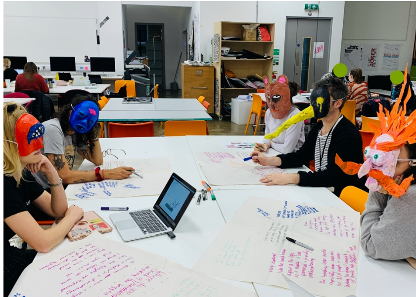
Figure 10 A group discussion amongst final year students, the masks were submitted as part of a small group crit and worn in this photo for fun.