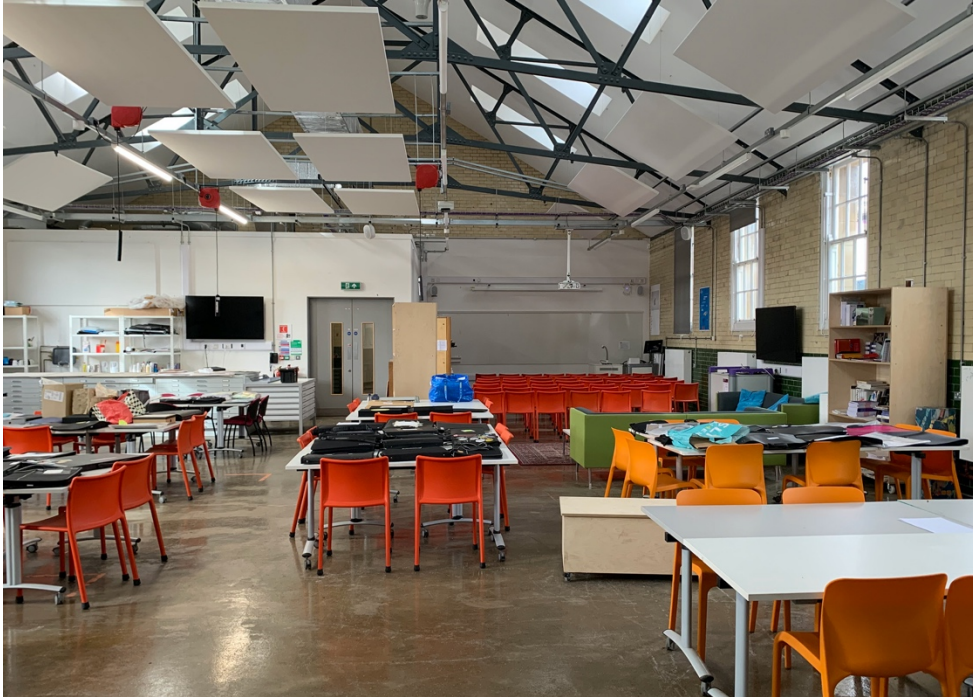
Figure 2 Educational Studio with work laid for assessment. [X Caption].

While the studio is a setting for the creation of cultural artefacts, it is definitively not the place where these creations are validated. Validation happens in other spaces – galleries, supermarkets, cities, and media (Wilkie and Farias 2016). See fig 3. Ultimately anything made in a professional studio finds its actual validation outside of the studio. No amount of user testing or prototyping can fully predict how things will be received and used. Even the most rigorous testing can result in commercial or critical failure, a point made by socio-material scholars: