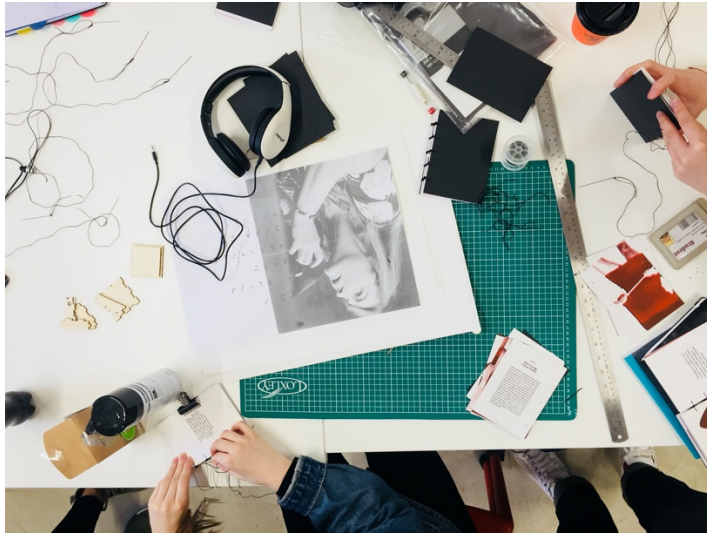
Figure 6 Making in an educational studio

cannot be reduced to some of its qualities, properties or figurations takes site. The studio appears thus as a site in which one lives with objects and materials, and where tinkering and invention result from long term engagement with them". (Wilkie and Farias 2016:11)