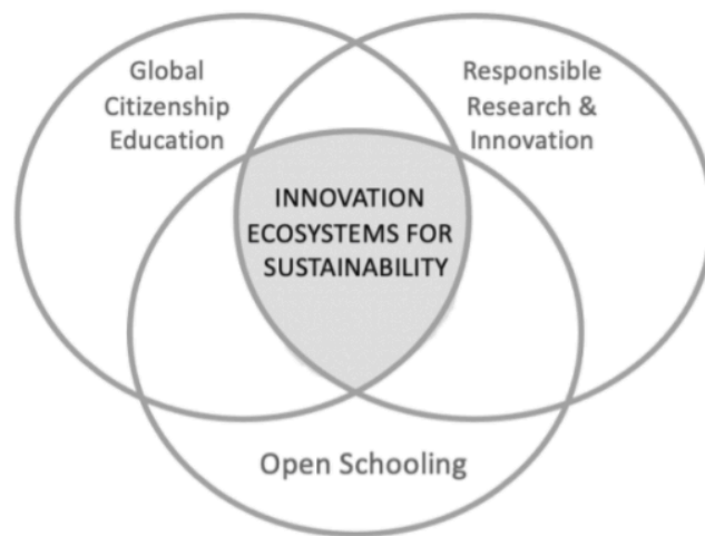
Figure 20.1 Innovation ecosystems for sustainability.

This chapter is part of a study conducted within the CONNECT Project (a European Union-funded project with the Global South – developing countries located in the southern region of the globe) which focuses on inclusive open schooling with engaging and future-oriented science. This project aims to create more opportunities into the school curriculum for students to interact with scientists, talk about science with their families, and enjoy taking science action for sustainability. The chapter investigates, for the first time, the intersection between open schooling, GCDE, and RRI (see Figure 20.1). It uses the lenses of less well-representative actors and territories to identify the key components of sustainability within the innovation ecosystem. It investigates these key elements for educators as they implement open schooling in the Brazilian semi-arid region in a context of adversity imposed by a pandemic. The research also identifies drivers and challenges to open schooling in this context based on the innovation ecosystems theory/concept.