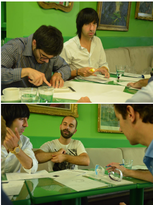
Figure 1: Prototyping in the co-creative workshop

at workspaces, in particular creative co-working spaces. This interactive seat, with embedded sensors and actuators, aims at reimagining the role of interactive technologies in the workspace of the future by challenging disruptions in shared workspaces through a multi-sensory design approach. SENSE-SEAT aims to explore the balance between social interruptions and social benefits of the creative workspace. Creative industries—workers are becoming more prominent as countries move towards intellectual-based economies. Consequently, the nature and essence of the workplace needs to be reconfigured so that creativity and productivity can be better promoted at these spaces. We will introduce initial interview studies, a co-creative workshop - both of which informed the design - and early renders and 3D prints of our prototype. We also present the rationale for how the design has been developed and our initial findings from the prototyping efforts.