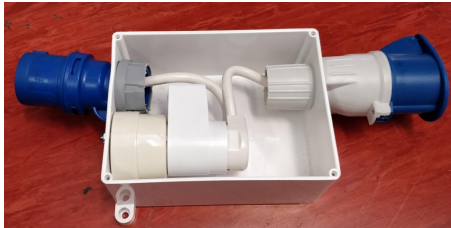
Figure 2: Assembly of the components needed to measure and control the consumption, the CE16 male and female sockets are position towards the outside of the box, and the smart plug is placed inside