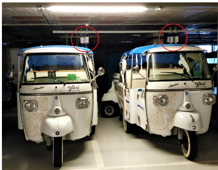
Figure 4: Charging infrastructure of the TukxiTours business with the MyTukxi hardware installed (highlighted at red)

Currently, all the hardware/software infrastructure described in the sections above is deployed, and 3 drivers from the TukxiTours are using the mobile application to track the electric scooters usage. In this initial period, the main goal is to test all the components and its integration. So far the system has logged approximately 25 trips and 60 battery status. Furthermore, in this period interactions with the drivers allowed us to gather inputs important to design the mobile application described previously, it also allowed us to better understand TukxiTours needs for the smart-charging algorithms. More concretely in a workshop with its drivers, we learned that: 1. Sometimes the scooters need charging in the middle of the day, 2. The drivers use a Whatsapp group to inform which scooters are available, being used or charging, 3. The scooters should be unplugged when the battery is fully charged otherwise the battery could malfunction; the drivers need to keep a record of all the distance traveled daily.