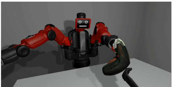
Figure 1. Top: Example VR robot models arranged according to their anthropomorphism. (R0) one arm basic; (R1) an articulated arm; (R2): two arms Baxter; (R3): a humanoid robot. Bottom: an example VR-collaboration scene used by the authors, developed with Unity Game Engine (Unity Technologies, San Francisco, CA, USA). The scene shows a basic tool-passing task in which subject kinematic and physiological data can be recorded in response to manipulated scene features (e.g., cobot appearance, speed, etc.).