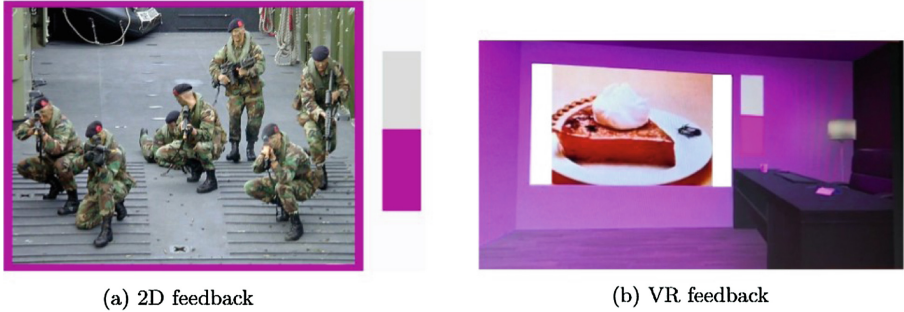
Fig. 1. 2D (a) and VR (b) feedbacks (Color figure online)

During regulation, the feedback was provided by the colour bar (on the right hand side) and by the frame (placed around the images). Figure 1-a shows the 2D-neurofeedback application.