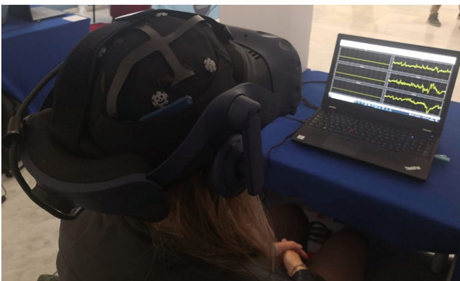
Fig. 3. Experimental setup

The present pilot study enrolled three healthy participants (mean age 48.5; two males and one female). All subjects were not familiar with emotion-related BCI experiments and VR systems. All participants gave written informed consent to participate. Ethical approval in accordance with the declaration of Helsinki was obtained from the Ethics Committee of Psychological Research of University of Naples Federico II.