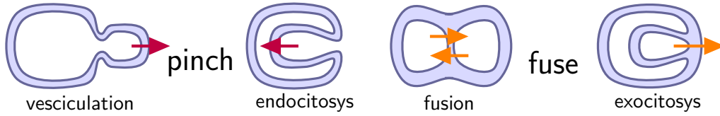
Figure 1: Vesculation and endocytosis can be generalized by means of an inward and outward pinch, and fusion and exocytosis by a horizontal and vertical fuse, respectively.