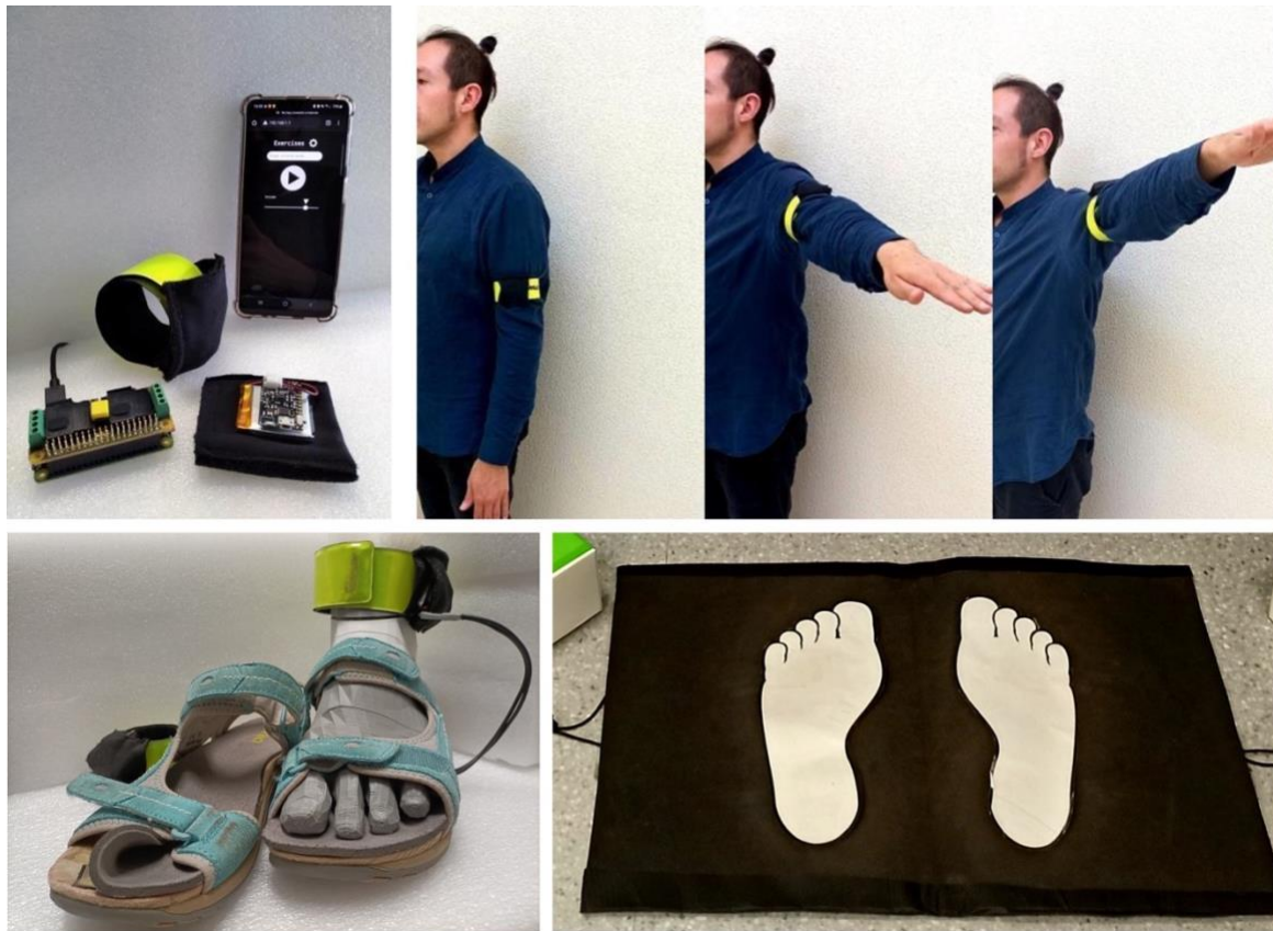
Figure 2: Technological Probes brought to the workshop. Top left: Soniband is a wearable band that integrates a BITalino R-IoT embedding a 9-axis Inertial Motion Unit (IMU). The R-IoT transmits movement angle data wirelessly to a Raspberry Pi Zero, which can be controlled using a web browser in e.g., a smartphone. The device registers the minimum and maximum angle of the body part (calibration), and then it sonifies movement angle real-time with five movement-sounds: “Wind”, “Water”, “Mechanical”, “Ascending Tone” and “Beep.” (see more details in [21]). In the workshop, the participants could choose the movement to sonify and the sound. Further details can be found in [21]. Top right: Example of movement sonified by Soniband. Bottom left: Sonishoes integrate a Soniband worn in the ankle and a sole that detects pressure against the ground and “sonifies” steps. Sonishoes allowed five different movement-sound conditions: “Aluminum can crush” (replicating the sense of pressing a coke can against the ground), “Wind” (a pink noise sound changing frequency which plays during the foot swing of a stride or in response to changes in leg angle), “Water” (a continuous sound of water running with a “splash” sound at certain angle), “Mechanical” (a gears sound changing with angle), and “Tone” (a continuous tone plays from start to end of the movement). Further details can be found in [20]. Bottom right: Sonicarpet is a simpler version of Sonishoes, which just sonifies steps when stepping on it (i.e., when detecting pressure against the ground).