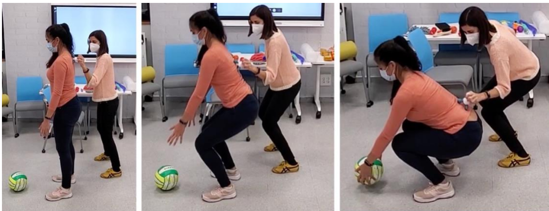
Figure 4: Design Idea 2 - Pulling up and down through traveling vibration. The device would accompany the movement of the wearer with vibrations moving in the direction of the movement. In the sequence above, participants explored squatting with the device to pick up an object on the floor. While moving down, the vibration would travel from top to bottom along the spine, and vice versa. The participants described how this device enhanced their inner drive to move and facilitated their movement. They felt as if it was “pulling” them up or “pushing” them down.

Last, we conclude with a preliminary prototype built after the workshop to materialize both design concepts for further evaluation. This prototype delivers vibratory patterns through vibrating minimotor discs placed along the spine and extending laterally from the spine towards the shoulders, waist, and lower back areas (see Figure 5 ). Inspired in Design Idea 2, these vibrators activate sequentially, from bottom to top, during an upwards movement, or reversely during a downwards movement. Vibrations could be also delivered just to the lower back like in Design Idea 1. Future steps involve testing this prototype with users in the two scenarios proposed by our participants.