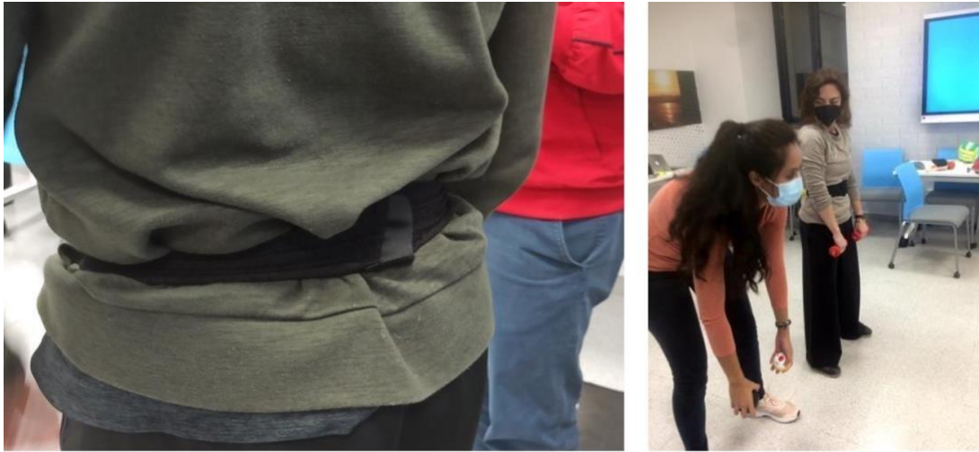
Figure 3: Design Idea 1 - A waist band correcting posture through vibrations on the lower back. The device consists of an elastic band around the waist (left) that would be used to monitor weightlifting exercises (right) and signal incorrect back posture through vibration, which would trigger immediate posture correction.