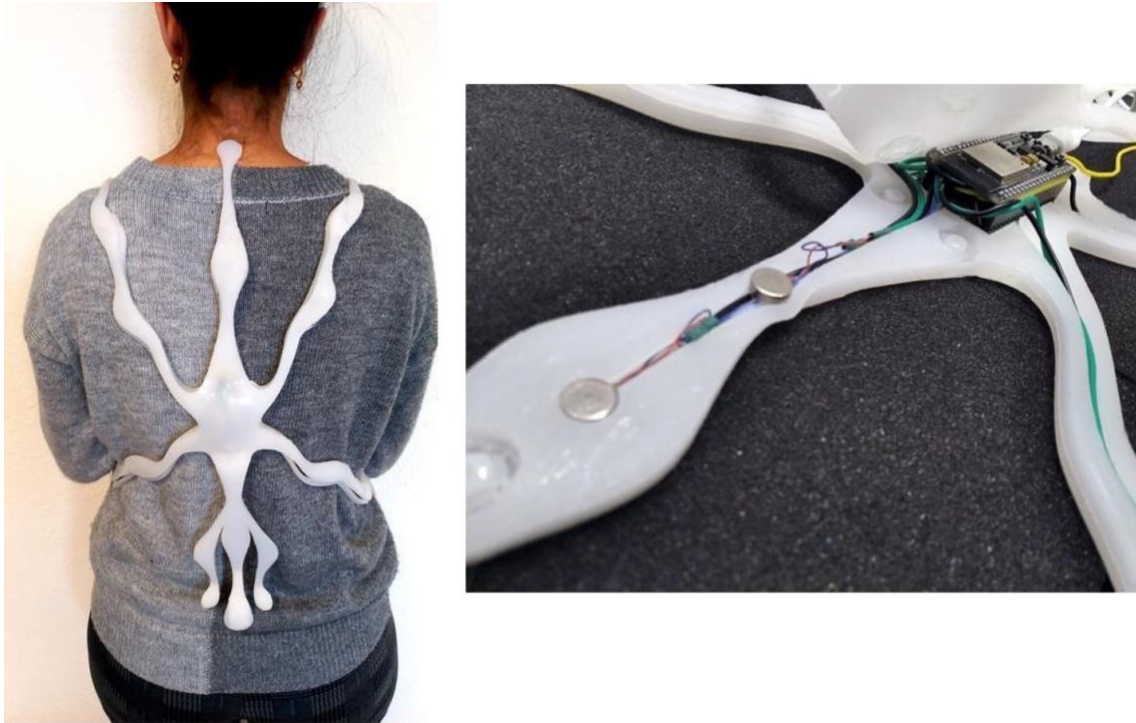
Figure 5: Prototype to correct posture and facilitate the inner drive to move during PA. The prototype is made of silicon and integrates a microcontroller with an array of transistors and vibrating minimotor discs. The shape and material were chosen to allow placement in different sensitive and relevant body parts, such as the back, chest, or thighs. Vibration could also be configured in different patterns, speeds and frequencies, and could be activated when detecting a particular movement angle or acceleration.