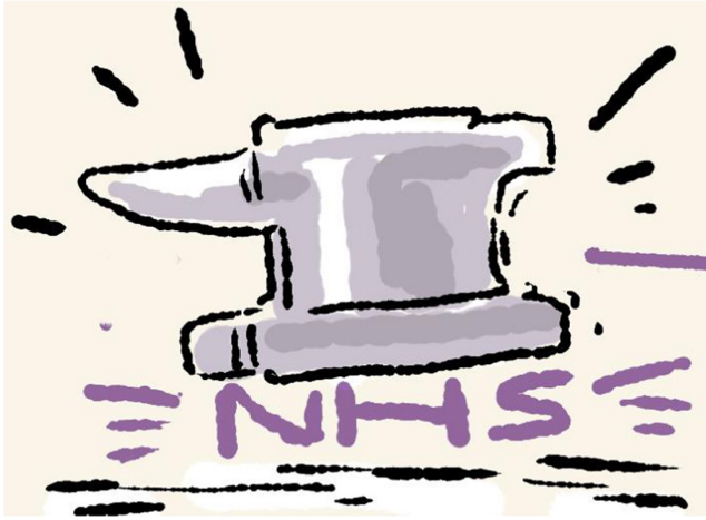
FIGURE 2 Illustration representing themes designed by a “live scribe” who drew this during a presentation of our data

In the lead-up there were lots of unknowns, lots of uncertainties. It was business as usual until we realized the scale of it, then it was a quick 10 days where we were like, we really need to prepare for the worst. What are we going to do?