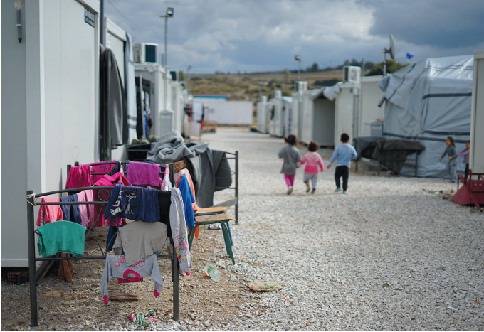
Photo: Syrian refugee camp in the outskirts of Athens. Over 6.6 million Syrians were forced to flee their home since 2011. Many are still stranded in refugee camps in Turkey and Greece, waiting (and hoping) to be granted asylum in European countries or beyond. According to the United Nations Universal Declaration of Human Rights of 1948, “everyone has the right to seek and to enjoy in other countries asylum from persecution”. In practice, despite the existence of well-founded fear of persecution, many host countries are not upholding the basic right of asylum. (Source: Julie Ricard, via https://unsplash.com/photos/MX0erXb3Mms . No permission needed).

From March 22, 2020, to February 26, 2022, there had been 38 394 PCR-confirmed COVID-19 cases in NES and 1552 confirmed COVID-19 deaths, bringing the official case fatality rate in NES to 4% [17]. However, given the testing and tracing capacity issues mentioned above and the lack of access to health care services in the region, these figures are likely underestimates of the true extent of the COVID-19 outbreak in NES [18]. In December 2021, the number of reported cases declined significantly because of laboratory testing interruptions and struggles in securing consistent support for the Qamishli Central laboratory [19]. However, reporting with limited capacity resumed in January 2022 [20]. The 916 new confirmed COVID-19 cases in NES in February presented a 217% increase from the 289 confirmed cases in the previous month [17]. Despite this increase in positive cases, the number of COVID-19 deaths declined during the same period. Notably, as of September 2021, over 1206 of the estimated total 8900 health care workers (13.6%) in NES had experienced confirmed COVID-19 infection [21]; creating further consequences for the health system.