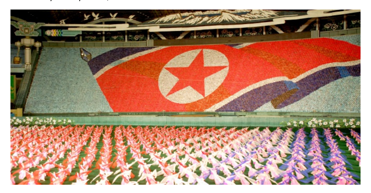
Pyongyang, Arirang (Mass Games), North Korea, 2007.