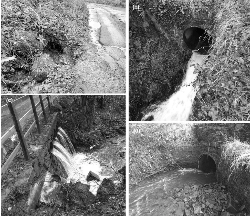
Fig. 3. Examples of culverts on small rivers with high gradients in River Usk catchment, United Kingdom. The culvert in (a) is viewed from the inlet and no outlet was visible; it had been filled with sediment. The culvert in (b) is viewed from the outlet, which is perched several metres above the riverbed. The culvert in (c) has substantial physical degradation, is perched >1 m above the riverbed, as well as erosion and scouring alongside and below the outlet of the structure. The culvert in (d) had moderate physical degradation, particularly scouring at the base of the structure and cracking of stones on the structure.

Fig. 2. Distribution of road-river structure sensitivity (the intersection of gradient and Strahler stream order) and exposure (in relation to built-up areas and special areas of conservation designated for river-obligate species (shown at bottom of image)), where the intersection of high sensitivity and exposure (of any category) indicate vulnerability. Structures posing high risk of impact to the connectivity of rivers and communities (under flooding) intersect at high vulnerability (the intersection of high sensitivity and exposure) and high flooding hazard (where the initial hazard categories of yearly flooding likelihood were low (0.1–1.0%), medium (1.0–3.3%), and high (>3.3%)). All species images were sourced from PhyloPic (phylopic.org): Salmon was created by Timothy J. Bartley and included in this article under a CC BY-SA 2.0 license; Lamprey by Christoph Schomburg, Shad by Felix Vaux, Bullhead by Unknown, and Pearl mussel by Katie S. Collins are all included in this article under CC0 1.0 universal public domain dedication.