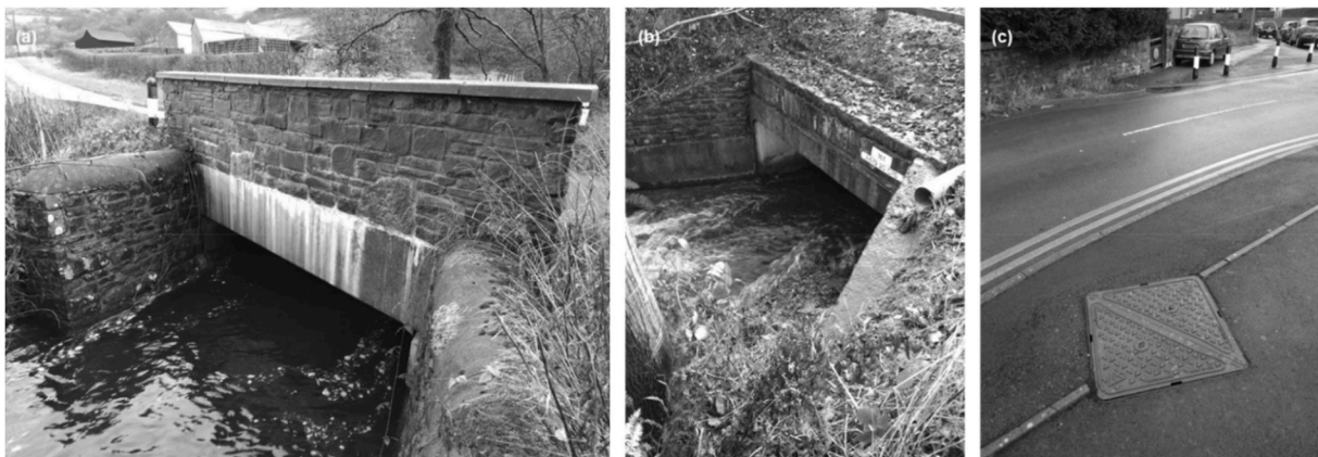
Fig. 4. Examples of culverts on small rivers with high gradients that either showed little to no evidence of physical degradation or could not be visually assessed in River Usk catchment, United Kingdom. The culverts in (a) and (b) were visually assessed and showed little to no evidence of physical degradation but had obvious streambank erosion and scouring at the structure. The culvert in (c) could not be visually assessed because it was under a human settlement.

washout, or collapse), or interaction with the river (e.g., presence of a drop from a structure outlet to the river or no substrate in the structure) that are relevant to decision making about transportation networks and freshwater species and habitats, are likely impractical or unobtainable