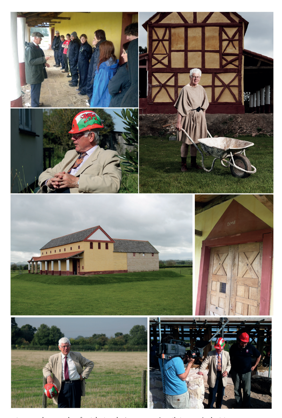
Figure 6. Photographs of Dai during the 'Rome Wasn't Built in a Day' television programme (top left, lower left and right: Photographs by Howard Williams. Remainders by permission of Dai Morgan Evans' estate)