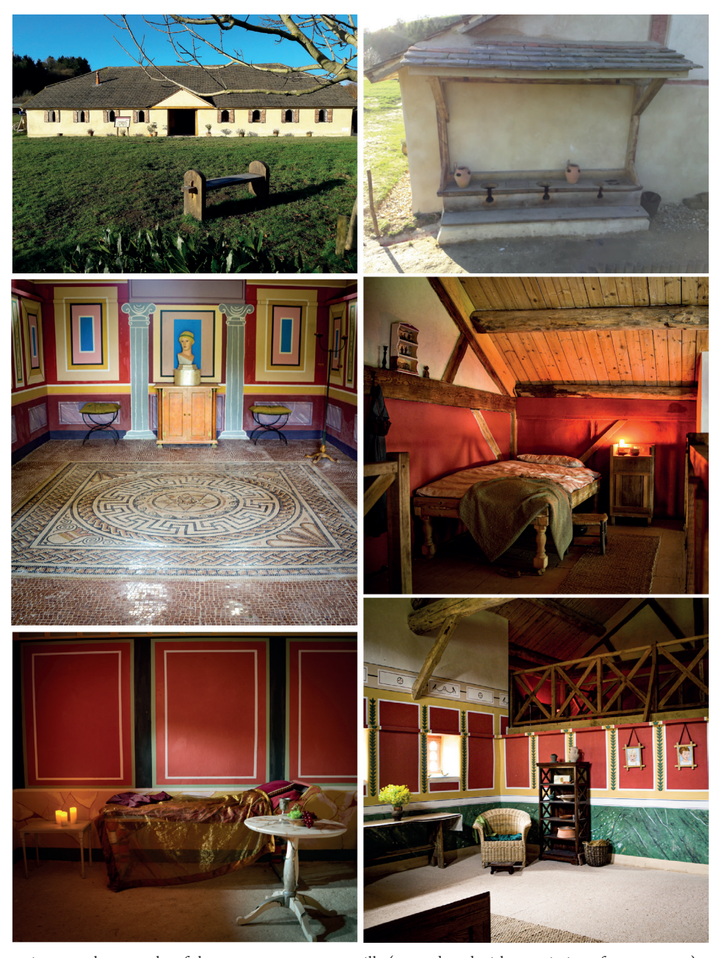
Figure 5. Photographs of the Butser Farm Roman villa (Reproduced with permission of Butser Farm)