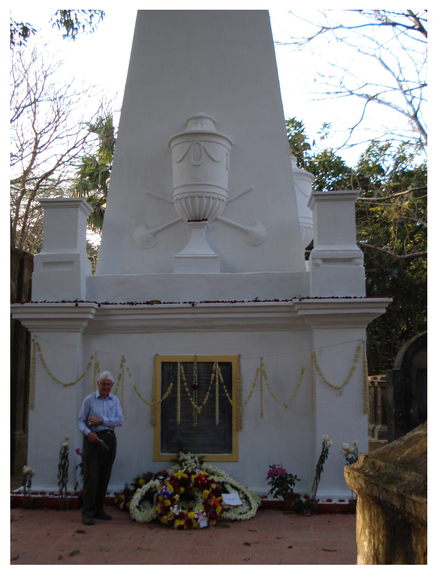
Figure 7. Dai at the tomb of Sir William Jones, Kolkata

and Sanskrit must, given their resemblances, share a common ancestry; thus providing the impetus for the development of comparative linguistics in the early nineteenth century and the use of the term 'Indo European'.<sup>39</sup> Jones is honoured with a monument in the South Park Cemetery, Kolkata (Figure 7) and the ongoing presence in the same city of the oldest institution of oriental studies in the world (now the Royal Asiatic Society of Bengal), founded by him in 1784. Despite his Welsh roots, there is no corresponding memorial in Wales, nor is it widely known that the inspiration for much of what he did, in the legal as well as literary