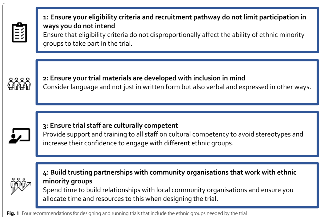
Fig. 1 Four recommendations for designing and running trials that include the ethnic groups needed by the trial

The recruitment pathway itself can introduce challenges to inclusion. Placing recruitment in, say, a hospital clinic makes an assumption that all potential beneficiaries of the trial intervention attend hospital clinics in the same way, which may be far from true. For example, some ethnic groups may be less likely to attend, or be referred to, those clinics, meaning individuals in these groups are, by design, less able to take part in the trial [15–17]. Using UK care homes to support recruitment to falls prevention trials is likely to disproportionately benefit White British people because a larger proportion of older adults from ethnic minorities are cared for in the family home [18]. Although it is beyond trial researchers to improve