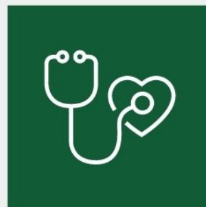
Cardiovascular Diseases & Periodontitis