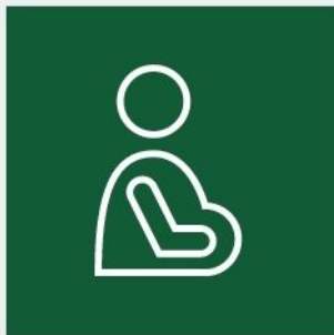
Pregnancy & Periodontitis

Visit the knowledge hub to access e-learning modules: