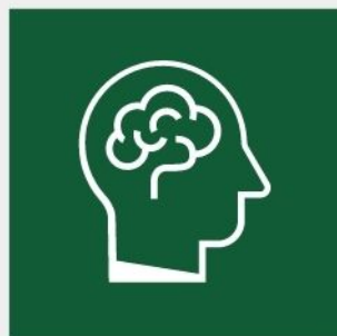
Cognitive Decline & Periodontitis