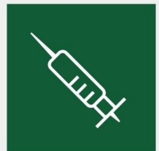
Diabetes & Periodontitis