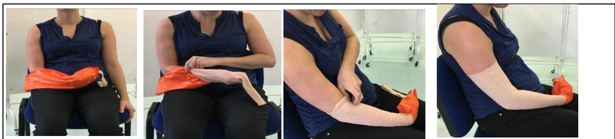
Figure 1: Step-by-step application of the Lycra Sleeve using the orange applicator