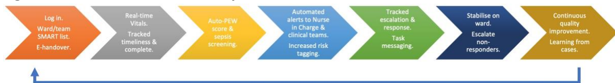
Figure 1: The DETECT surveillance system

The DETECT surveillance system is supported by System C’s, CareFlow Connect and Vitals (paediatric version) apps. Vitals is an electronic observation and decision support system, which involves staff using an electronic hand-held device (iPod touch in this study) to record children’s vital signs. The recorded signs include breathing rate, effort of breathing, oxygen saturation, oxygen requirement, heart rate, blood pressure, capillary refill time, temperature, ‘alertness, verbal responsiveness, pain responsiveness, or unresponsiveness (APVU)’, and nurse or parental concerns (Figure 2). The recorded data automatically calculate a pre-defined PEW score, which categorises the risk (low, moderate, critical) of developing serious illness. CareFlow Connect is an encrypted communication system, which interacts with Vitals to provide automated alerts about the sickest children, generated from the PEW score or suspicion of sepsis, and includes the ability to escalate concerns direct to the clinical team who can respond in real-time, without the nurse leaving the child’s bedside. These modified apps are referred to as DETECT e-PEWS and are used by health professionals using iPods to document vital signs or respond to alerts of deterioration triggered by the system.