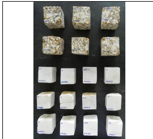
Fig.2: Marble and granite samples: (S) samples treated with Ethyl Silicate, (H) samples with a hydrophobic product, (S+H) samples with both treatments, and (N) non-treated samples.

and granite from the Front Stage of the Roman Theatre (Figure 2), material present in many other remains of the city, due to the proximity of the quarries [1].