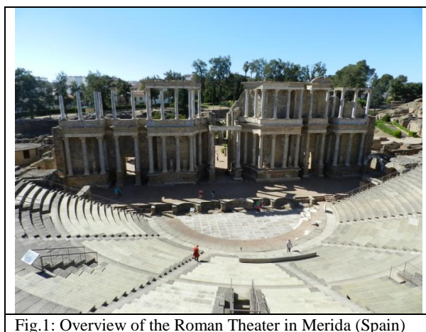
Fig.1: Overview of the Roman Theater in Merida (Spain)

Emerita Augusta (Merida) is a Roman archaeological city listed by UNESCO in 1993, where the Theater is the most representative monument of the whole ensemble (Figure 1).