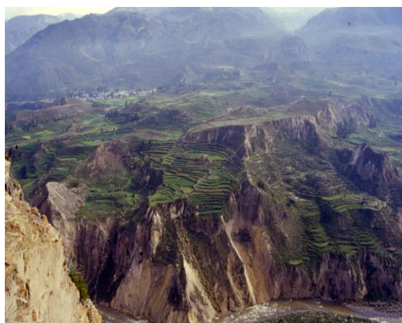
Figure 5. One of the most known and at the same time, ancient examples of terracing is in the Colca canyon in the south of Peru. It is considered the deepest canyon in the world and terraces date back to the Inca period (1400-1500 CE).

scale farming. Figure 6 shows an example of a soil anthro-chrono-sequence on marly-limestone substrata in an area characterized by large scale farming for vineyards cultivations in Sicily (Italy). The last soil in the sequence is