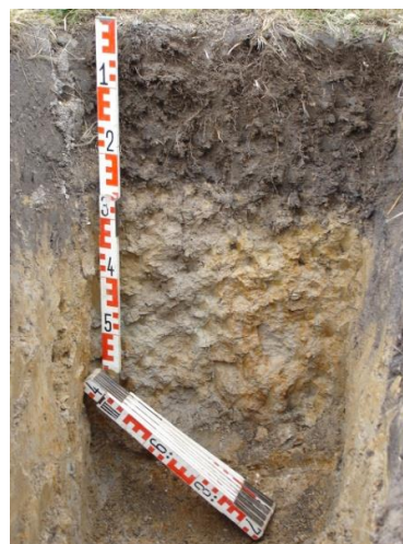
Figure 2. A Gleysol that, artificially drained start to become a Cambisol.

and some names have been suggested [15] - [16] - [17] - [18] - [19]. In the WRB these soils were not retained as Anthrosols because of they have not been subjected, for a