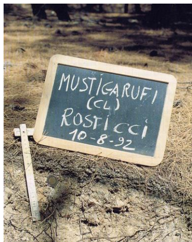
Figure 3. Haplic Regosols (transportic).

This type of anthropogenic soils refers to deep plowing, ripping, battlefields, trenches, excavations, pipelines, construction sites, cemeteries, broken hardened layers or pans. These soils show no diagnostic horizons or only fragments which are not arranged in any discernible manner. Soil Taxonomy [12] recognizes Arents for these types of