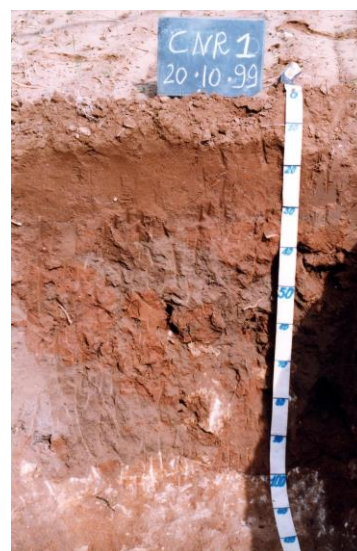
Figure 4. Aric Regosols (eutric).

The most evident and extensive changes of soil characteristics induced by humans are those affecting the topsoil as a result of activities such as tillage, deforestation, liming, irrigation, fertilisation, drainage, contamination by heavy metals or nuclides, pollution by acid aerial deposits or biocides. Topsoil fertility is of primary importance for soil management and crop production. However, the characteristics of the topsoil have not received a proper recognition in the current systems of soil classification because attention was mainly given to the subsoil, the more stable part of the soil profile over time. Therefore, the soil classification systems in many cases do not consider the differences in topsoil and, consequently, natural soils and agricultural soils can belong to the same soil taxa. For instance, changes in soil organic matter and increase of cations in topsoil do not allow separating these soils. Same situation for the topsoil changes due to liming or due to erosion (as a result of deforestation and forest fires) or the