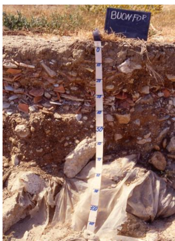
Figure 7. Technosols mainly made by artifacts.

Man, now considered the sixth and most incisive factor of pedogenesis, will increasingly influence the soils of tomorrow (Dudal, 2005). It is therefore justified the