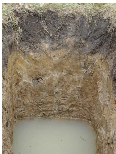
Figure 1. A Gleysol with a relatively shallow water table.

The terric horizon (as well as the plaggic) owes its genesis to the presence of less fertile soil and with low capability such as Arenosols, Podzols and Albeluvisols (sometimes also Fluvisols and Gleysols). It is an anthropogenic mineral horizon made by timeless addition of hearty material, compost, sludge, etc., while the ortic horizon is an anthropogenic mineral horizon made by prolonged cultivation and fertilization and/or continuous