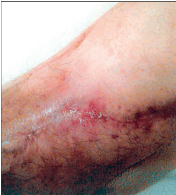
Figure 3 - Patient's ulcerative lesion after treatment.

CT scan of the leg showed a high intensity area around the left proximal tibia. Blood culture identified MSSA with the same susceptibility profile as MSSA isolated from the skin biopsy. Consequently, the patient attended the "Orestano Clinic" Day Hospital facility to undergo the following 4-day therapeutic cycle: PGE 1 (alprostadiol 60 mg/