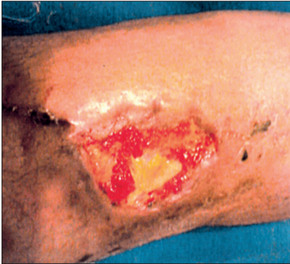
Figure 2 - Patient's ulcerative lesion on admission.

CT scan of the leg showed a high intensity area around the left proximal tibia. Blood culture identified MSSA with the same susceptibility profile as MSSA isolated from the skin biopsy. Consequently, the patient attended the "Orestano Clinic" Day Hospital facility to undergo the following 4-day therapeutic cycle: PGE 1 (alprostadiol 60 mg/