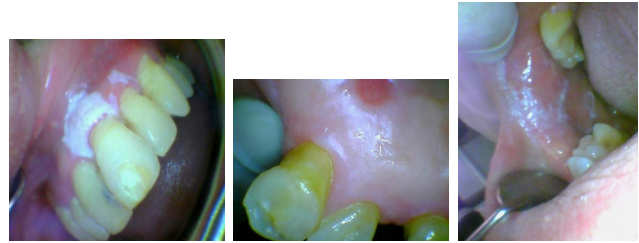
Fig. 3. a) Oral leukoplakia on gingiva of upper incisors; b) Provisional remote diagnosis, thanks to telemedicine, of a potentially malignant lesion of palatal mucosa, a non-homogeneous (white and red) form of lichenoid lesion. c) Definitive clinical remote diagnosis, thanks to telemedicine, of a true reticular lichen planus, in vestibular and retro-commissural mucosal area

A teledentistry system aimed to second opinion has been presented in this paper. It is a low cost system and doesn't need particular internet connection. It allows to perform a medical examinations session on the patients also when the physician is not logged. A better intra-oral camera will be used for future versions of this system: even if other manufacturers provide intra-oral cameras whose features are lower than the one used in this work, we will investigate on the use of the real-time video streaming without any artifact introduced by