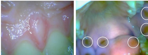
Fig. 1. Image acquisition with the intra-oral camera HK-790. LEFT: an image acquired without any artifact. RIGHT: White circles put in evidence some artifacts introduced by the intra-oral camera during the streaming mode.

physician is online, he/she will find the requests previously sent by the operator. There will be a request for each patient. The physician can select a request and a web page with an image gallery will be shown. The physician can select the more interesting images to include in the medical report.