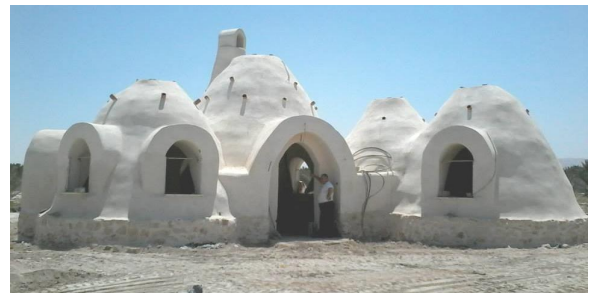
Figure 1. Earthen house in Jericho by Shams-Ard group