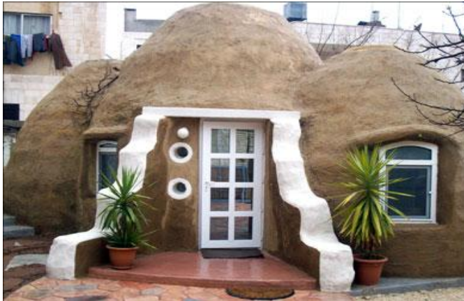
Figure 3. Earthen house in Jordan by Jana Khalili

Other architects also assures these problems facing the building sector. But all of these personal or organizational efforts must be followed by intensive public efforts to achieve a group of guidelines for the future of the region.