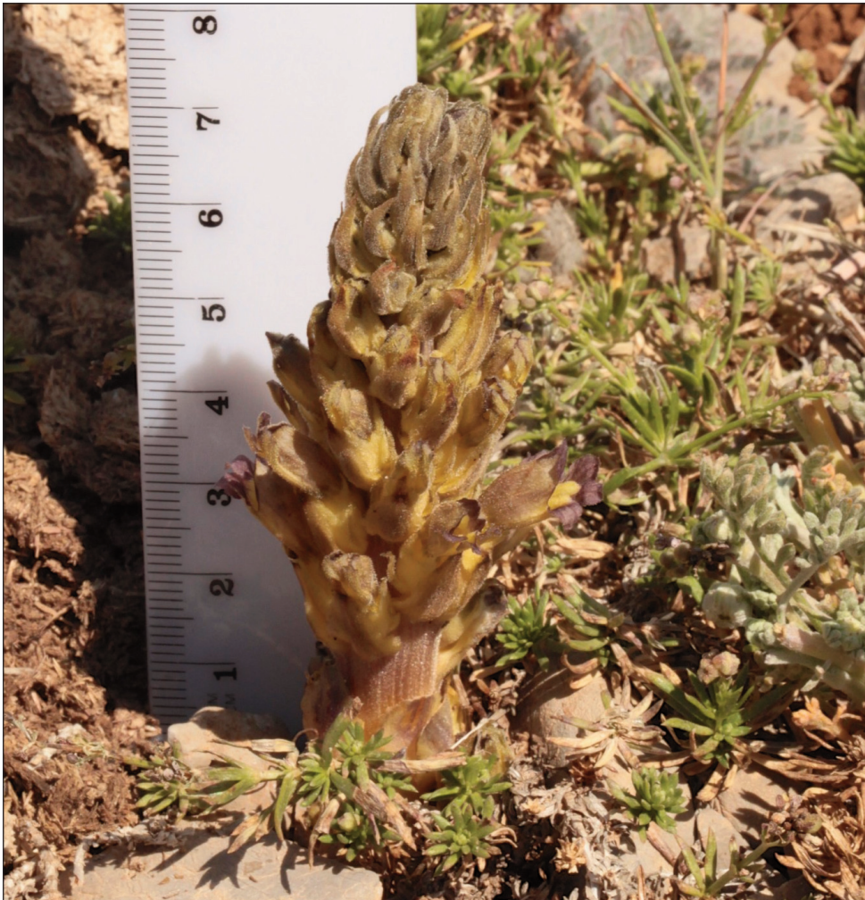
Fig. 2. Orobanche cohenii in the field.

Planta puberula; caulis crassus, firmus, simplex, rarius interdum in basi ramosus, parcesquamatus, inferne squamis laxis, oblongo-lanceolatis. Spica conica, densiflora, compacta. Flores 19-23 mm longi; bractae lineari-lanceolate, acuminatae, 10-15 mm longae, calycem longitudine aequantes vel superantes; bracteolae lineares, 5-7 mm longae, calyce breviores. Calyx stricte campanulatus, 5-dentatus; dentibus triangularibus, sub-aequalibus, tubum brevioribus vel aequantibus. Corolla tubuloso-campanulata, puberula, infra insertionem staminum angustata, leviter arcuata, lutea ad limbum versus violacea; 19-22 mm longa; limbus lobis subaequalibus, rotundatis, deorsum curvatis. Stamina in tertio infirmo corollae inserta; filamenta in basi cum tubo corollae insertionem barbata; antherae subglabrae.