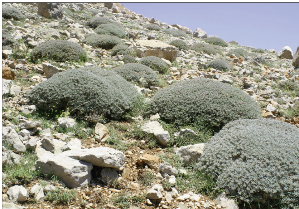
Fig. 4. Tragacanth vegetation dominated by Astragalus cruentiflorus on a stony-rocky west-facing slope of Mt. Hermon.