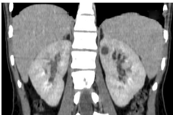
Figure 3 Coronal multiplanar reconstruction (MPR) of the abdominal CT scan revealed a hypodense lesion in the upper pole of the left kidney.

On the basis of the radiological findings, miliary TB was suspected and bronchoscopy was performed together with a bronchoalveolar lavage (BAL) in order to search for Mt by means of polymerase chain reaction (real-time PCR, Cobas TaqMan MTB PCR system) and culture. A urine sample was also tested for the same reason. Both cultures were positive, whereas PCR identified Mt only in the BAL fluid. Miliary TB was confirmed and treatment with four drugs was started in accordance with the WHO guidelines (isoniazid 10 mg/kg/day, rifampicin 15 mg/kg/day, ethambutol 20 mg/kg/day, and pyrazinamide 35 mg/kg/daily) [6]. The therapy was rapidly effective as the fever disappeared within a few days, the abdominal problems resolved, and the patient's general condition improved together with a gain in body