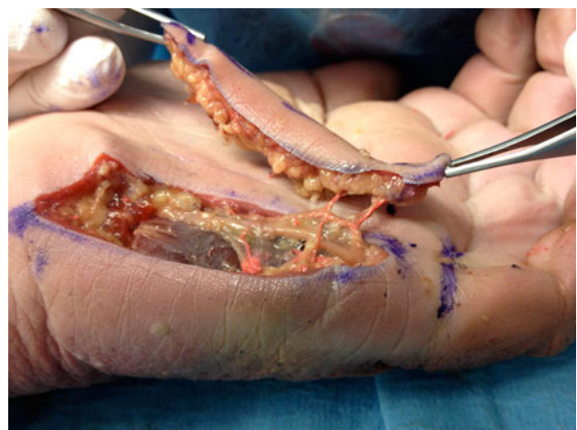
Fig. 2 Distal perforator of the ulnar palmar digital arteries

The rich vascular network of the hypothenar region has raised the interest of several authors, who explored its potential as donor site for local or free flap for hand defect coverage. An hypothenar fat pad flap for recalcitrant carpal tunnel was described by Plancher et al. [14]. Kinoshita et al. [6] and Kojima et al. [7], respectively, provided anatomical studies and clinical series for a subcutaneous pedicle flap and a reverse vascular pedicle hypothenar island flap. Omokawa et al. [11, 12] identified the constant vascular supply of the distal half of the ulnar aspect of the hypothenar eminence from the ulnar palmar digital artery