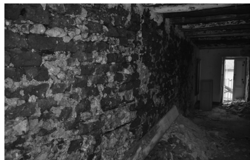
Figure 3. Wall in the second storey of a historical building in via Spinuzza in Cefalù (photo by M. Calìo & M. Guercio, 2010).

of the three storeys of the building, which is made mainly in stone (Fig. 5). One might surmise that, in the absence of financial means, the adobe wall was built to meet the need for more space.