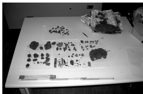
Figure 7. Aggregates found in the sample extracted in via Spinuzza a Cefalù.

Now the adobe wall is covered by plaster, and only in two little recesses has it been left visible. In 2012 a sample was removed (Fig. 6), to examine the components of the mixture forming the bricks (whose dimensions are about 8 \times 18 \times 40 cm). Preliminary analysis showed that slightly clayey earth was kneaded with sand and with heterogeneous aggregates: straw and terracotta fragments, bone splinters and slivers of wood, pieces of reed or little shells (Fig. 7). Radiocarbon dating carried out by CEDAD (CENtro DATazione e Diagnostica, University of Salento) on the vegetable fibres contained in the sample, date this find to a period range most probably around 1640 AD.