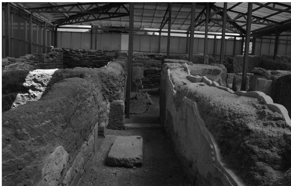
Figure 1. Eraclea Minoa (Agrigento). Domus, 2nd/1st century BC.

However there remains the question as to why there was a clean break with building technique such as adobe, which was also widely used all over the island until the Hellenistic-Roman period. This interrogative gathers strength from an observation from neighbouring Calabria, where the same tradition of earthen bricks in the archaeological field was subsequently carried on until the