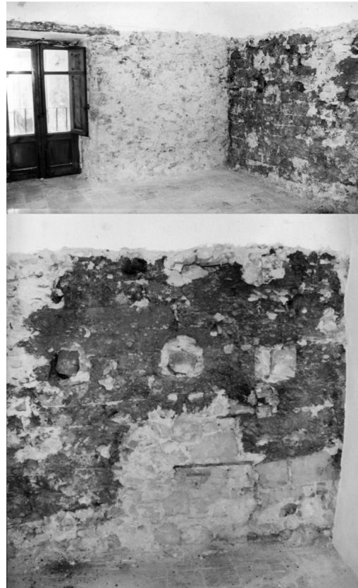
Figure 2. Inner wall in historical building in Cortile Rosariello, near S. Domenico (17th/18th cent. AD) in Cefalù. Photos dated 1995, found in Archivio Culotta in 2012.

The second circumstance occurred in 2010, during works aimed at creating bed & breakfast accommodation in an inconsequential building in the historical centre of Cefalù, when a wall in adobe was found by Mario Calìo and Monica Guercio, architects skilled in bio-architecture (Figs. 3-4). This wall stands in the second, and partly the third,