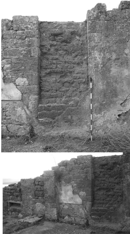
Figure 12. Solunto, Isolato 7 UA XIV. Casa a peristilio , I/II sec. BC.

little cavity fillers or completion of stone-walls have been found (Figs. 10–11).