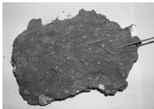
Figure 6. A piece of the sample of adobe extracted in via Spinuzza a Cefalù.