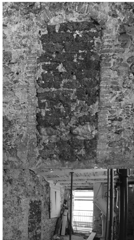
Figure 11. Empty in a stone-wall, filled-up by earth bricks, in a old building in via Vanni, Cefalù.