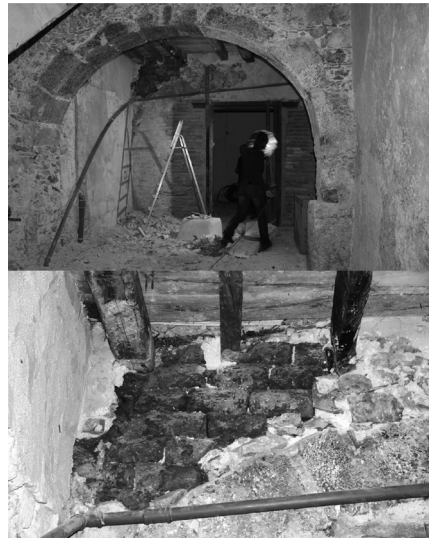
Figure 10. Filling made of earthen bricks over an arch, in a building in via Botta in Cefalù (photo by F. Vaccaro, 2013).