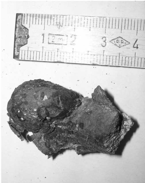
Figure 8. Crucified Christ papier-mache fragment found in the sample from via Spinuzza, Cefalù.