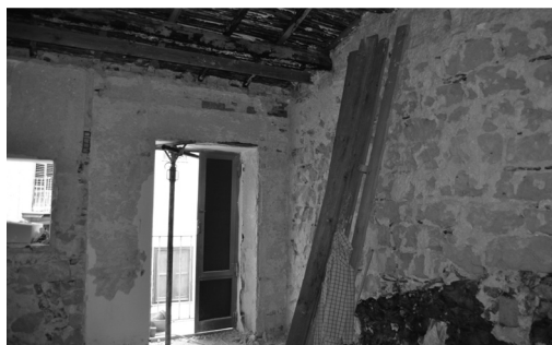
Figure 4. Third storey of a historical building in via Spinuzza a Cefalù; on the lower right, the wall in adobe.