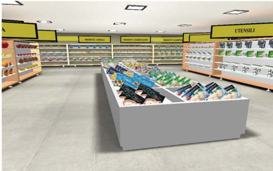
Fig. 1. Virtual Version of the Multiple Errand Test (V-MET).