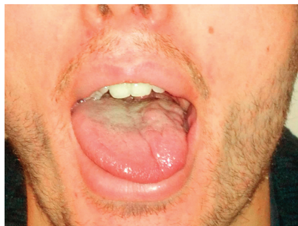
Figure 2. Unilateral hypoglossal nerve palsy. After 30 months of follow-up the patient's neurological examination remained unchanged.

Correspondence: A. Calvo, ALS Centre, 'Rita Levi Montalcini' Department of Neuroscience, University of Torino, Torino, Italy. E-mail: andreacalvo@hotmail.com