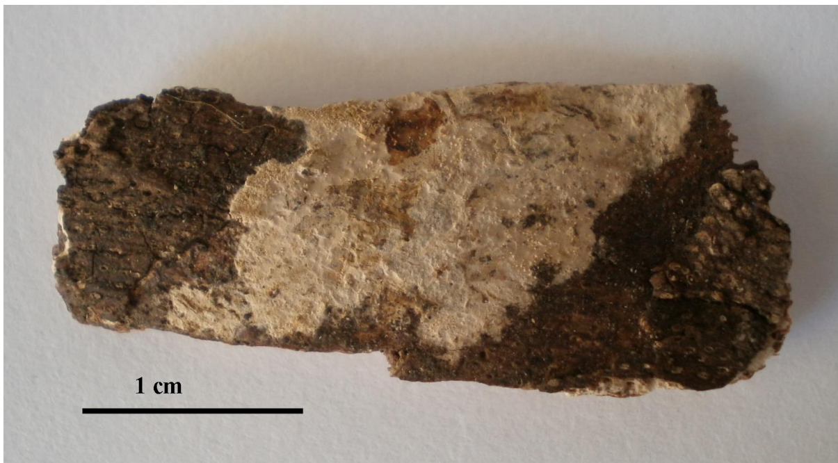
Fig. 1 – Leptocorticium gloecystidiatum sp. nov. (holotype). Aspect of the basidiome.

Other material examined – L. tenellum : Chile, Los Lagos, Puyehue National Park, 21 Feb 2010, on Chusquea quila (Poaceae), coll. N. & L. Hallenberg, S.P. Gorjón, NH 16294 (GB).