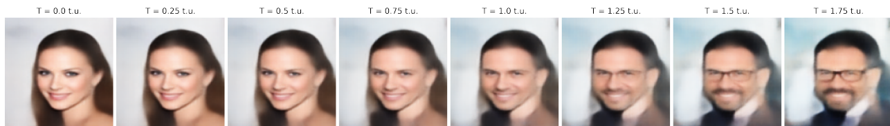
Figure 3. Results of excessive integration of the transport flow. A model trained to map males to females in 1 t.u. is integrated backward for more than twice the map horizon. We observe that the generated samples retain semantic sense for up to about 1.5 times the training horizon.