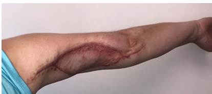
Clinical photograph at the postoperative follow-up demonstrating healing split thickness skin grafting.

from GAS NF, treated all individuals that had positive cultures with oral amoxicillin, and reported no subsequent cases of GAS NF.