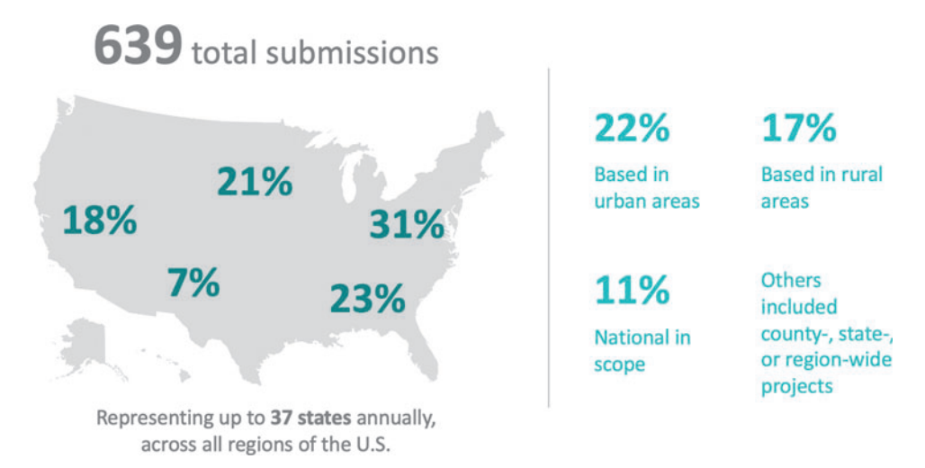
FIG. 1. Geographic distribution of Hearst Health prize submissions, 2015–2019.