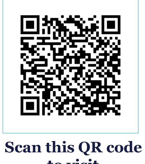
to visit our Resource List

This QI project is actively working to address current health disparities and improve mental health outcomes amongst postpartum patients through increased collaboration between Jefferson Departments of Obstetrics & Gynecology, Psychiatry, and community organizations.